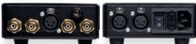
ABOVE: The PWX II power unit, on the right, connects to the phono stage itself via a Neutrik locking 4-pin plug. A second power outlet is also provided